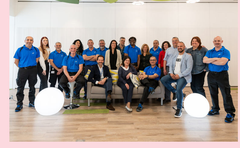
Speaking with the General Services' Technical team of the FCC Group

Read these two interviews in We Are FCC magazine no. 30