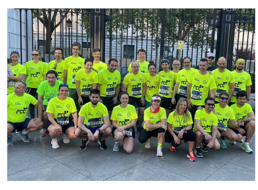
Many of the FCC Group's employees participate in the Madrid Race against Cancer