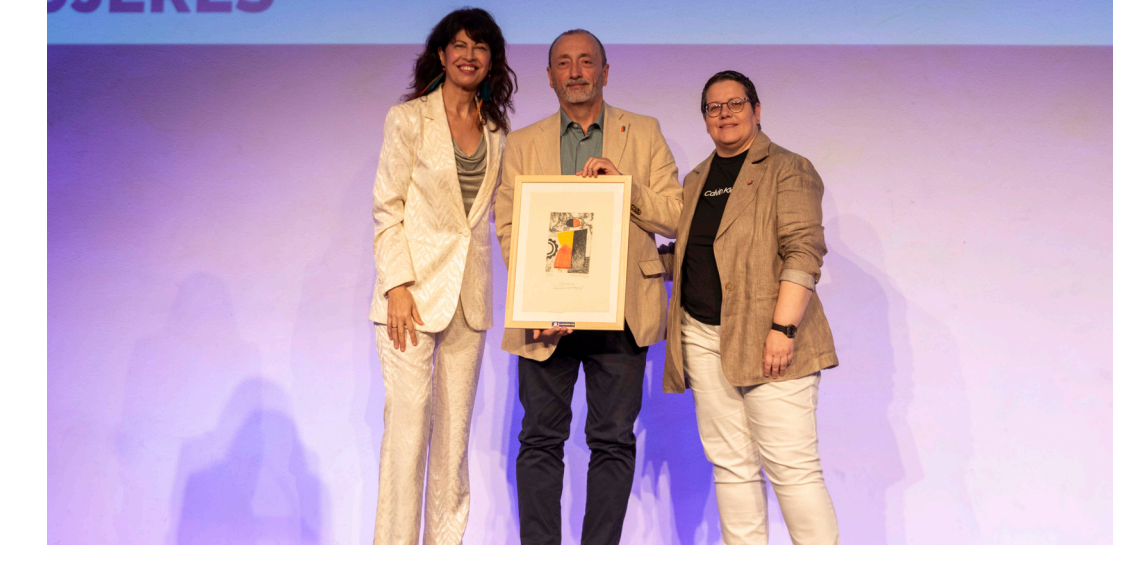
FCC Medio Ambiente receives the Seal of Distinction "Equal opportunities employer" from the Ministry of Equality