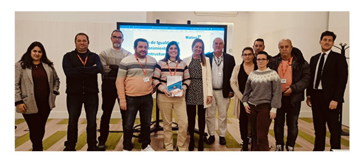
Matinsa signs its second Equality Plan