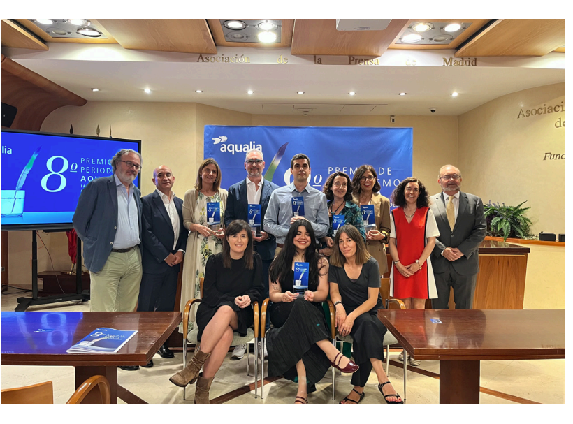
The awards of the 8th Aqualia Journalism Awards focus on the importance of managing all phases of the water cycle